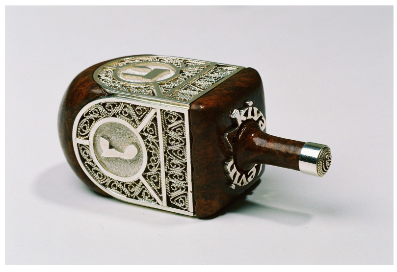
Dreidel "Ilia": Silver, wood

One challenge I face is not having a solid connection to other jewelers in the area. As I mentioned about learning and working more with filigree, it would be great to cultivate connections locally to be able to learn and discuss processes with others interested in jewelry-making. Discussing a variety of approaches to creating within my field is one of the ways to gather knowledge and ideas. I would enjoy exploring that collaborative element in my work, if possible.