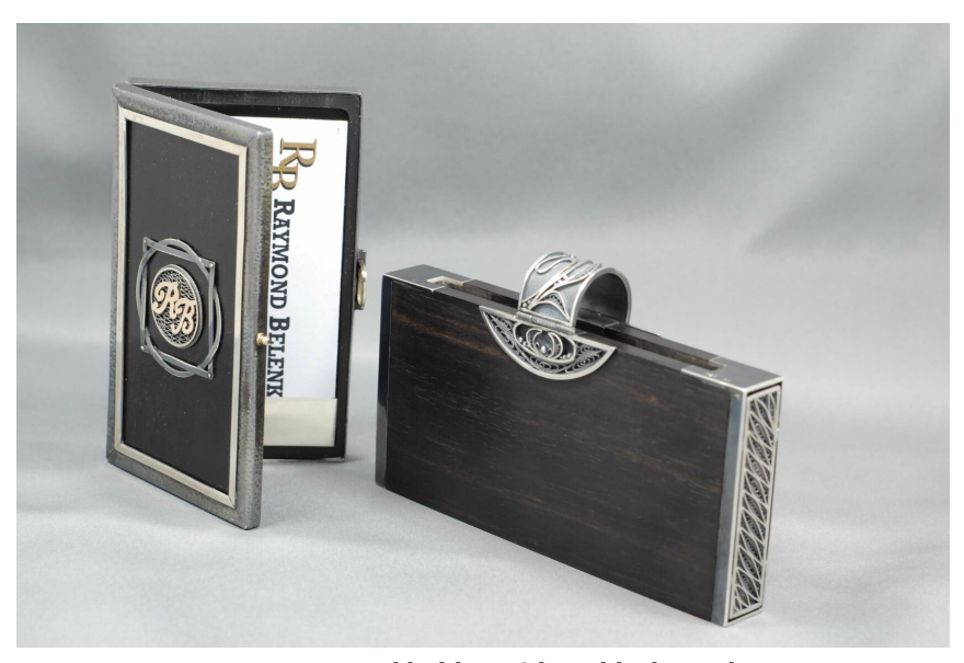
Business card holders: Silver, blackwood

For more artist interviews and other Windsor-based projects, follow the Vanguard Youth Arts Collective on Facebook and Instagram @vanguard.collective and stay tuned for our next issue!