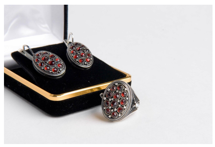
"Secret" ring and earrings set: Silver, pearl, garnet

tools to use and sent me off to practice on my own. I was determined to accomplish what I started — earrings for my sister. However, I haven't stopped there.