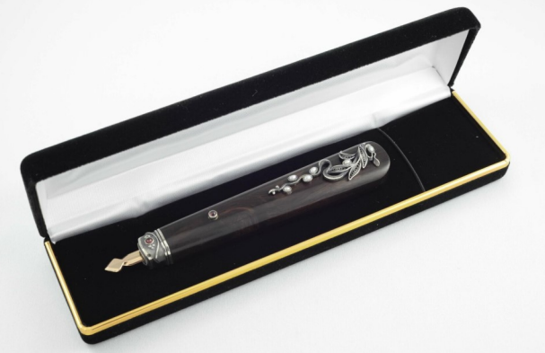
Retractable envelope opener: Silver, blackwood, pearl, almandite