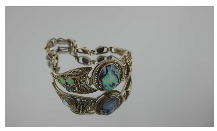
"Lake at night" bracelet: Silver, mother-of-pearl

I take inspiration from the objects I see in everyday life. Sometimes, I get inspired by works of art, and sometimes something simple catches my eye: a paper knife or a business