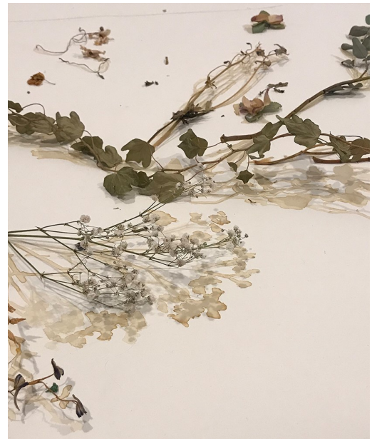
Close-up of 'Untitled (beauty and decay)'

I'll be struck with inspiration by things I see or have read; the antecedents to my work are often times very random. For example, I was researching Berghain, a techno club in Berlin; I was hit with inspiration, and the creation of the door installation 'Untitled (beauty and decay)' ensued. Following the initial idea, I write out my stream of consciousness with all associated words/concepts/ideas that come to mind. That allows me to visualize possible production methods and synthesize my intentions. After brainstorming, I typically have a strong vision and the act of creation comes naturally.