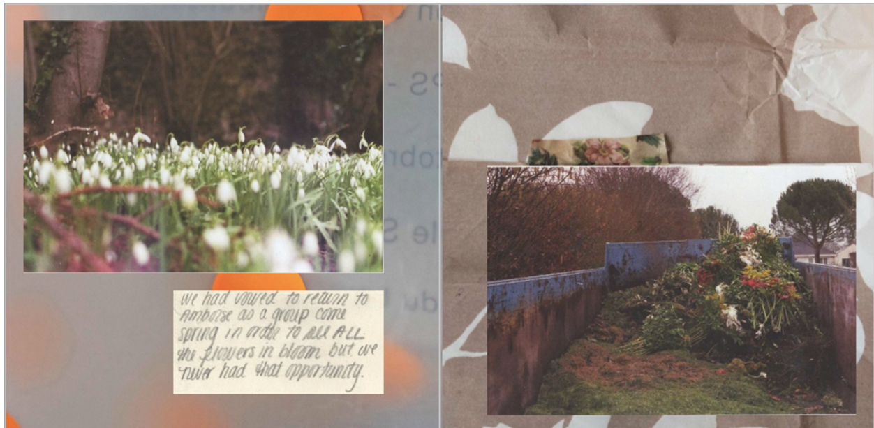
Fragments from 'Mon carnet de poche': print containing both analog and digital images, 2020

The above are pages from my self-published photo book, 'Mon carnet de poche,' where I compiled my experiences from studying abroad in France for a partial semester. I created a trompe l'œil collage documenting food wrappers, misdemeanours, and beautiful memories. I also scanned in handwritten notes that gave some context to the images.