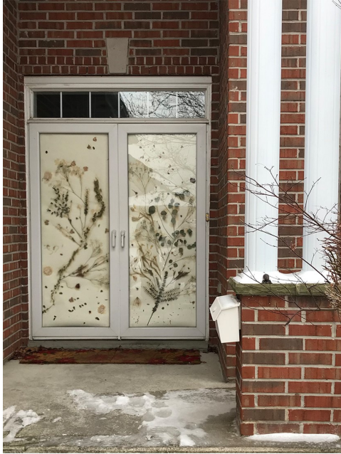
'Untitled (beauty and decay)': paper, dried flora, coffee, 2021

Playing with the concepts of beauty and decay, or beauty in decay, I sought to demonstrate notions of ephemerality. I installed the diptych to doors, which are transitory places, and I painted on the shadows of the flowers and stems with coffee, depicting a time and angle that once was.