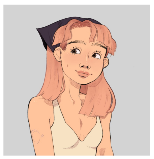
"Old Friends 2/2" (March 2020)

I've also been very inspired by the people in my life, my friends and family, and they really influence what I draw. Whenever I don't know what to draw, I'll look at pictures I took with my friends, or look at their socials to get inspiration — whether it's the outfit they're wearing or the pose they're in. They really motivate me to keep drawing, and their reactions to my art fuel me to keep drawing and to keep improving.