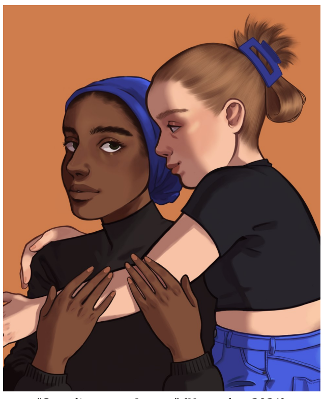
"Complimentary Lovers" (November 2021)

I'm actually in the middle of developing a zine featuring my recent art, and I want to release it at the beginning of the new year! Since 2020, I've started drawing a lot more and I figured it was about time to have an updated zine. I'm very interested in screen-printing and my