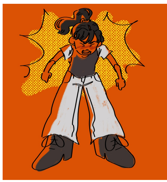
"Count to Ten" (June 2020)

I've also been very inspired by the people in my life, my friends and family, and they really influence what I draw. Whenever I don't know what to draw, I'll look at pictures I took with my friends, or look at their socials to get inspiration — whether it's the outfit they're wearing or the pose they're in. They really motivate me to keep drawing, and their reactions to my art fuel me to keep drawing and to keep improving.