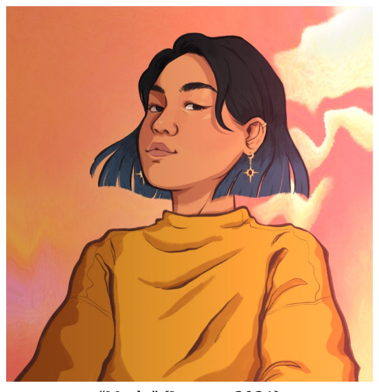
"Marlo" (January 2021)