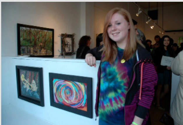
IMAGE: A student showcases her work at the “Working with the Environment Art Exhibition” Reception

ARTSPEAK GALLERY - Neighbourhood Spaces - Let's Work Together - AS PART OF MAYWORKS