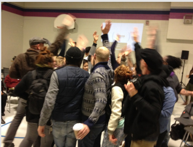
IMAGE: Neighbourhood Spaces artist in residence symposium participants