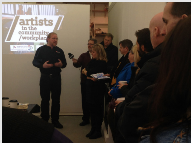
Presentation and celebration of an Artist in the Community Workplace Grant project at Civic Space.